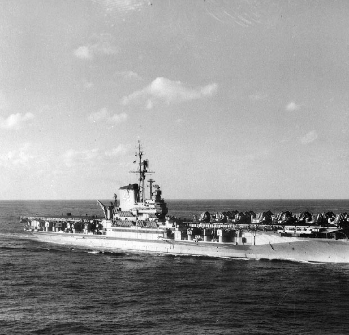
CVA 42 USS Franklin D. Roosevelt