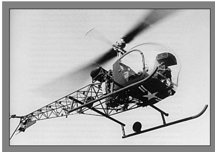
HTL-2 Bell model 47D

During the Fleet Marine Force, Atlantic (FMFLant) Fleet Exercise all the HRP's were still grounded (have been since 25 November 1949) consequently HMX-1 sent four (4) HO3S-1's and the one HTL-2 as a detachment to the Naval Air Facility (NAF), Roosevelt Roads, Puerto Rico.