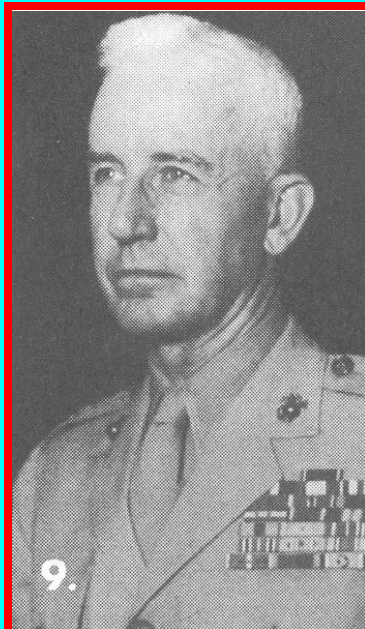
Maj Gen O.P. Smith