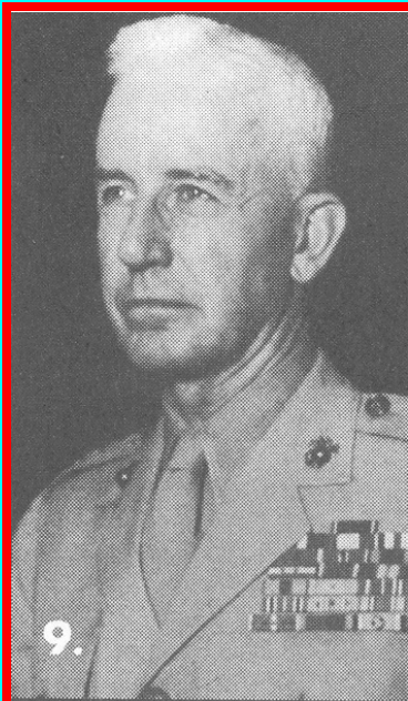
Maj Gen O.P. Smith