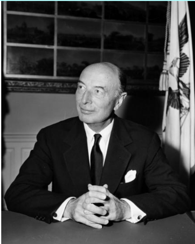
Robert Abercrombie Lovett

Assistant secretary for Air, Robert A. Lovett had tried to resign in September 1945, and Truman had refused, but he finally made it back home in December, only to be recalled to serve with General George Marshall as under secretary of state in July 1947. In January this year, he went back to his investment business but we will see him again, and soon.