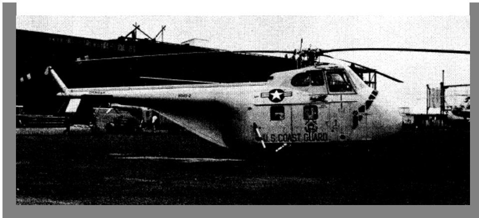
HO4S-1 HRS-1 ( H-19 after 1962)

The transport version of the HO4S—1 was redesignated as the HRS—1. Its design features included one Pratt and Whitney R—1340—57 600- horsepower engine installed behind clam-shell doors in front of the helicopter. Brigadier General Noah C. New in recalling this helicopter, states: