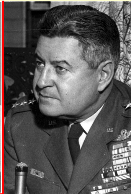
LtGen Curtis E. LeMay

After negotiations, MacArthur agreed to the proposal of Lt. Gen. Curtis E. LeMay , Commanding General of SAC , that the 31st Reconnaissance Squadron be returned to SAC for refitting and extended training, while LeMay would maintain six RB-29's in FEAFF on sixty day rotational duty.