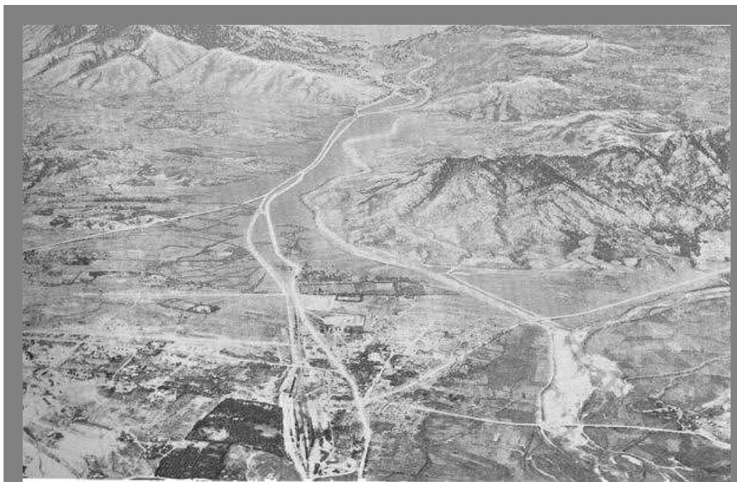
ENEMY APPROACH ROUTES through Uijongbu Corridor.